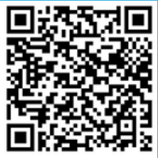
Exhibit Accessory Panel