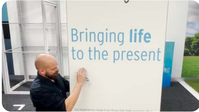
Exhibit Exhibition Stand - Attaching Hooks