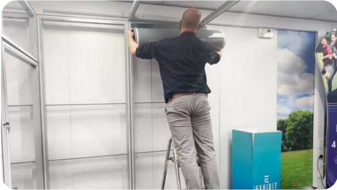
Exhibit Exhibition Stand - Attaching Panels