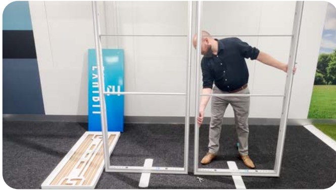
Exhibit Exhibition Stand - Connecting panels together (Straight configuration)